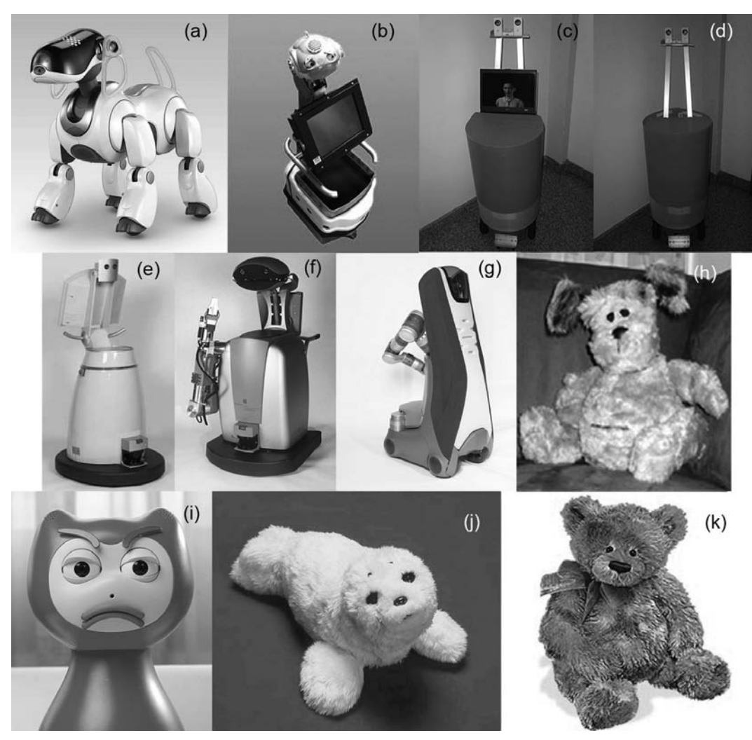
Figure 2. Assistive social robots; (a) Aibo, (b) Pearl, (c) Robocare with screen, (d) Robocare without screen, (e) Care-o-bot I, (f) Care-o-bot II, (g) Care-o-bot III, (h) Homie, (i) iCat, (j) Paro and (k) Huggable

Aibo is an entertainment robot developed and produced by Sony (Figure 2a)<sup>13</sup>. It is currently out of production. It has programmable behavior, a hard plastic exterior and has a wide set of sensors and actuators. Sensors include a camera, touch sensors, infrared and stereo sound. Actuators include four legs, a moveable tail, and a moveable head. Aibo is mobile and autonomous. It can find its power supply by itself and it is programmed to play and interact with humans. It has been used extensively in studies with the elderly in order to try to assess the